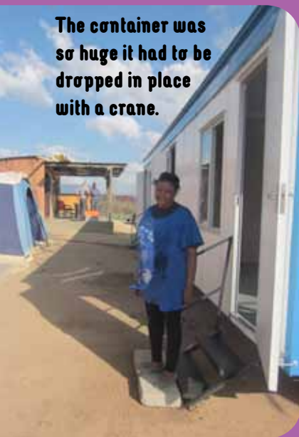
The container was so huge it had to be dropped in place with a crane.