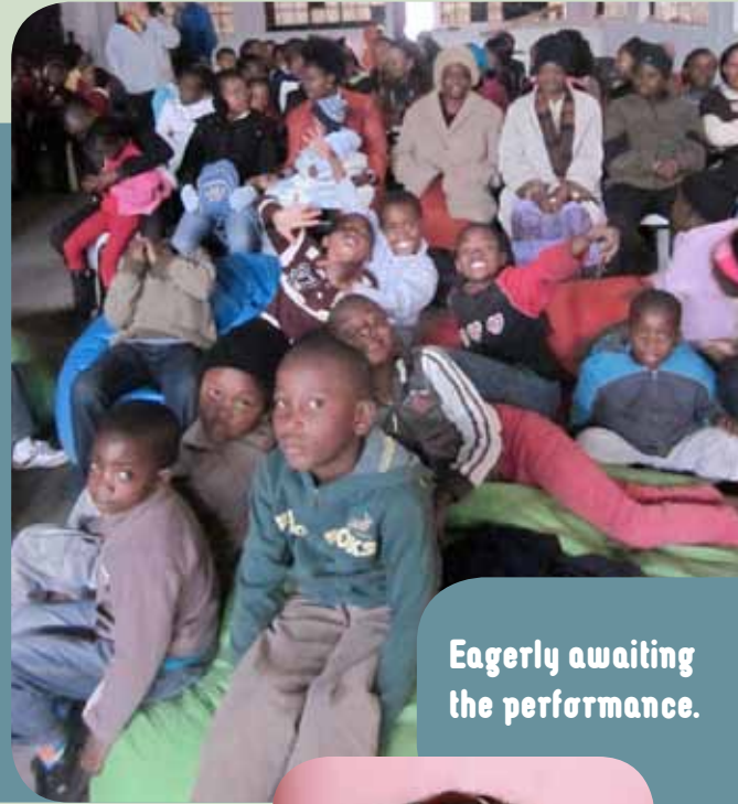
Eagerly awaiting the performance.

They plan to do further training and aerobics in this space. We have also erected fencing and new gates so the building feels more secure and safe.