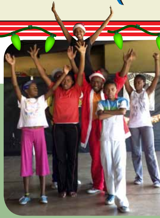
The brilliant township jive finale

The boxes were handed out, the countdown began... and then there was shouting and screaming as they unwrapped the contents. What an amazing day for the children... and also for the onlookers!