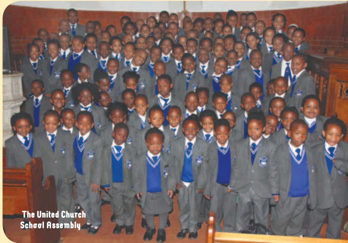
The United Church School Assembly