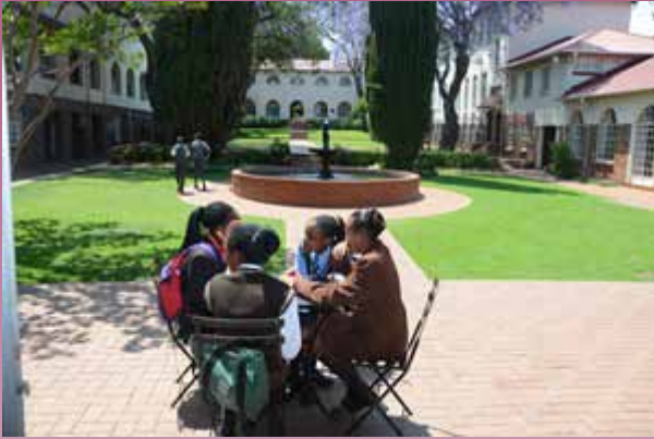
Lunchtime in the St Mary's beautiful grounds

St Mary's School, Johannesburg, has for the last 25 years recruited children from Alex schools as part of an Outreach Programme. Each year 250 children from Grades 9 to 12 spend Saturday morning at the school. Teachers and volunteers give up their time to coach the children in all subjects, but particularly Maths, Science and Accountancy. When the school term ends, they continue with holiday programmes and motivational talks by past students.