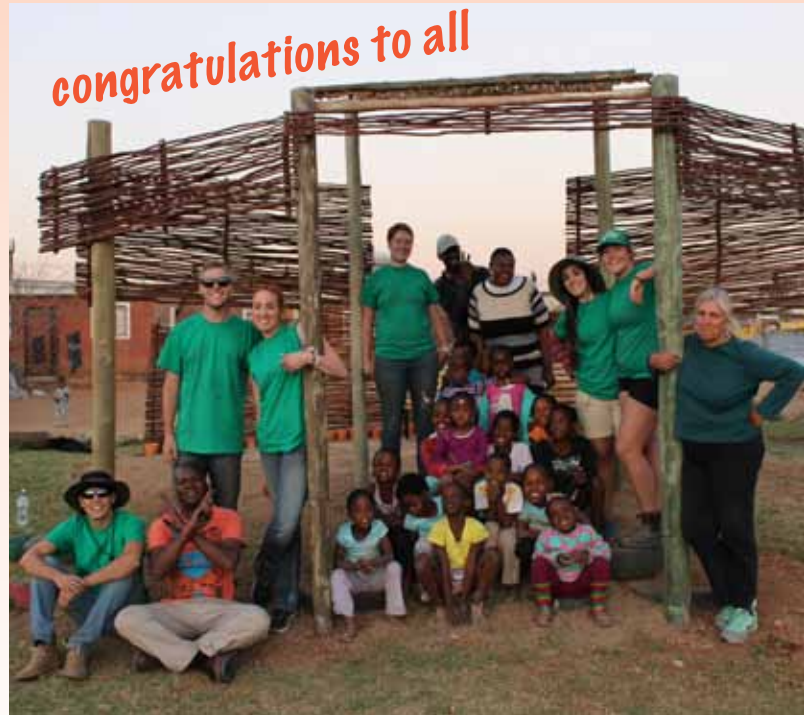
A well-earned break for the Cal Poly students

It has been recently announced that these students won the National Students Award of Excellence for this project. This is the highest award offered to students of Landscape Architecture in the USA. Kidlinks has been mentioned as a project partner and this will bring national awareness to their work. They were featured in Landscape Architecture magazine, and in addition, one of the pieces will be constructed and exhibited at the Museum of Modern Art in New York. This is a huge honour for the students – congratulations to all.