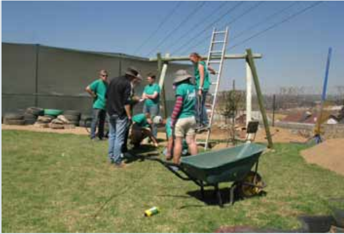
Mending swings and making little lives happier